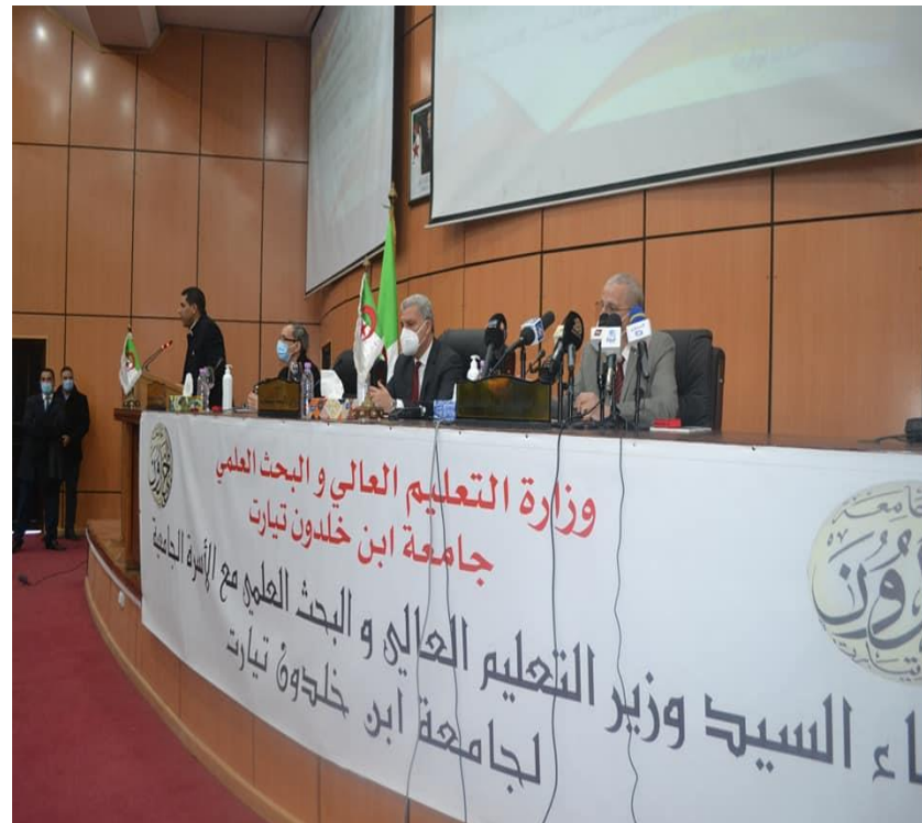
Visit of the Minister of Higher Education to the University of Tiaret (08/02/2021)