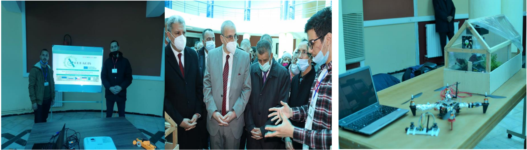
Presentation of the Cupagis project to the Minister of Higher Education (08/02/2021)